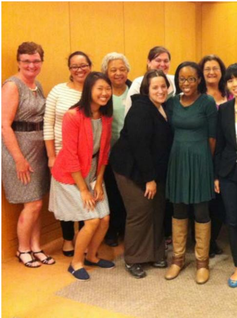
The class of IE LEADS fellows, aspiring library professionals working toward a MLIS degree.

was interested in attending library school (she is a recipient of IE LEADS and is now a librarian at UCR). The Laura Bush 21st Century Librarian Program “supports projects to recruit and educate the next generation of librarians, faculty, and library leaders; and to support early career research. It also assists in the professional development of librarians and library staff.” 1