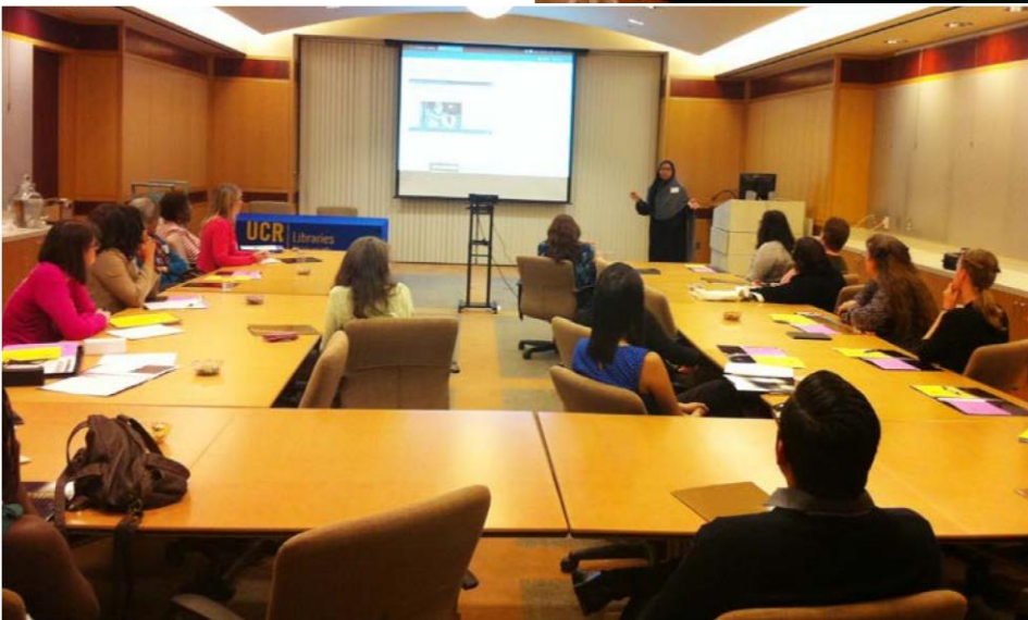
IE LEADS fellows meet with a mentor to discuss librarianship and their studies