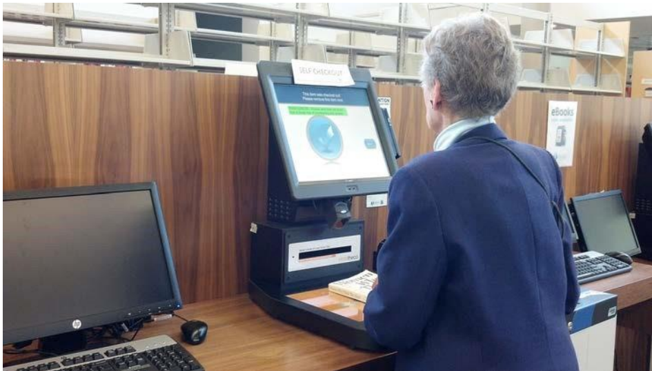
The RFID system has moved the check-in workflow from the library staff to the patron.

Overall, our move to RFID and self-service has been a great success. The self-checkout function has allowed us to reduce the number of staff based at the circulation desk and redeploy them to other roles and tasks. Specifically, they can now spend more time out on the library floor, attending to and interacting with patrons. We have also been particularly impressed with the increase in