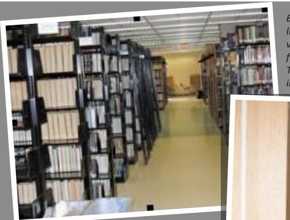
By decreasing the cross aisle from 72" to 42" the library was able to add an additional 13,000 volumes of capacity. The existing shelving was cut from 36" to 30" by the compact shelving installer. This alone saved the library over $12,000 in shelving costs.

In the first two weeks, the plan was to empty the shelving units so the compact shelving could be installed during the two-week March semester recess. Shifting collections and condensing material was the priority. As a result, 154 double-face units were cleared, which created the additional compact shelving system. A crew of eight workers along with hundreds of plastic crates and library carts moved more than 25,000 volumes per day. Although students were not on campus during the move, the library remained open. Daily meetings were established to measure progress, and the library staff was able to retrieve any item within twenty-four hours.