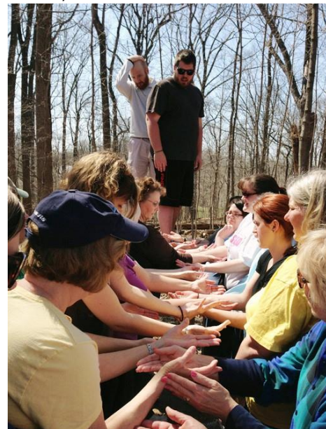
At a recent inservice, library employees prepare themselves for trust falls.

respond at staff meetings. One-on-one training time with the management team is also available, and employees are encouraged to take home devices the library now circulates, including laptops, iPads, and Roku Streaming Players, so they can practice using them and hooking them up. In short, if an employee does not pass the exam, they are not taking their job seriously.